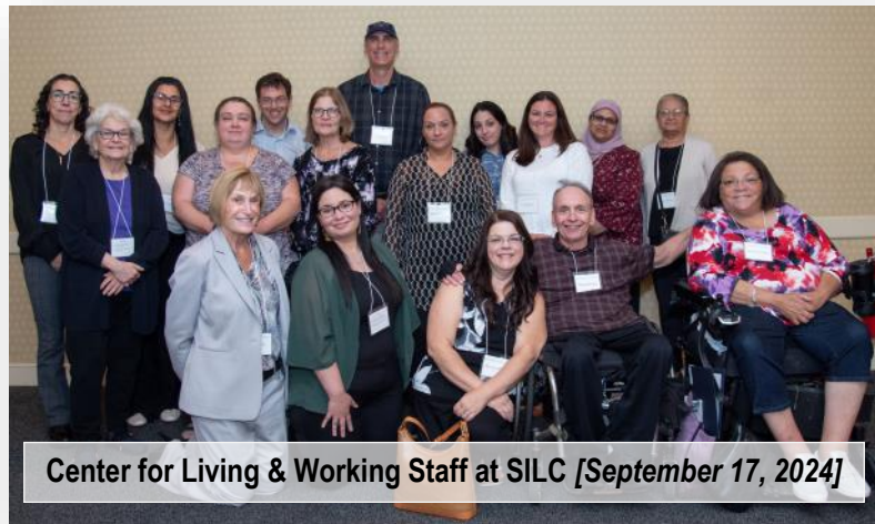
Center for Living & Working Staff at SILC [September 17, 2024]